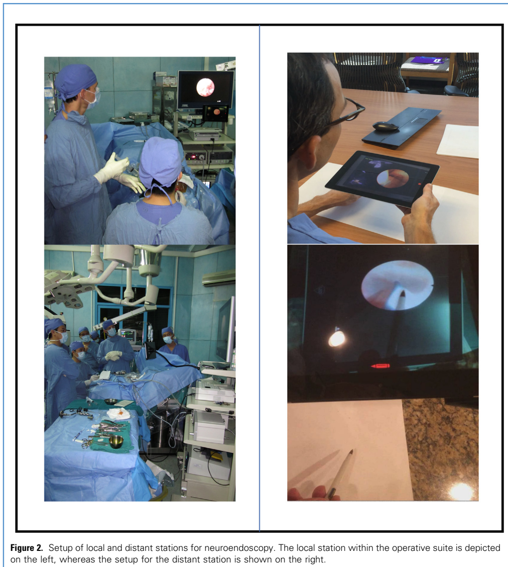
Figure 2. Setup of local and distant stations for neuroendoscopy. The local station within the operative suite is depicted on the left, whereas the setup for the distant station is shown on the right.

pediatric neurosurgeon per year. Southern Vietnam, with a population of nearly 50 million, is served by 10 pediatric neurosurgeons (D. Can, personal communication, 2015), with varying levels of subspecialty training. In certain cases, pediatric neurosurgery training is distinct from adult neurosurgery residency and consists of a 3-year program started immediately after completion of medical school, which lasts either 4 or 6 years. There are 2 pediatric neurosurgery training programs for all of Vietnam, one located in Ho Chi Minh City, and the second located in Hanoi. For the calendar year 2014, 613 total pediatric neurosurgical procedures were performed at Children's Hospital #2 (breakdown of cases provided in Table 1 ).