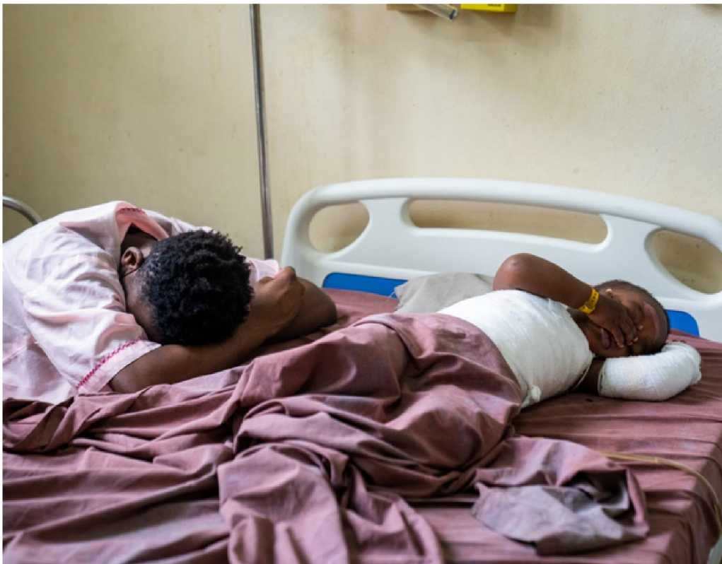
Mother getting a moment of rest while caring for her child while in hospital. The family members have to stay with the children 24/7 and act as nurses for them, as there is not enough nursing care to take care of all the patients. They end up feeding, helping with dressing changes, and giving medications to the children while there.