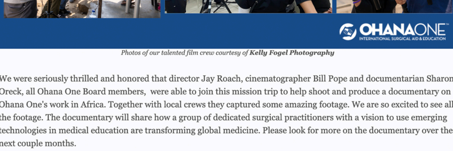
Photos of our talented film crew

The most exciting aspect of this mission trip was how these teams utilized smart glasses and TeleVU's immersive reality tech during every procedure. This allowed many healthcare professions to gain a fuller understanding of the mentee/mentor process in the Surgical Sight program. The Ohana One team was able to experience the mentee's and the mentor's perspective of this program, find areas for improvement, and celebrate the impact of the program.